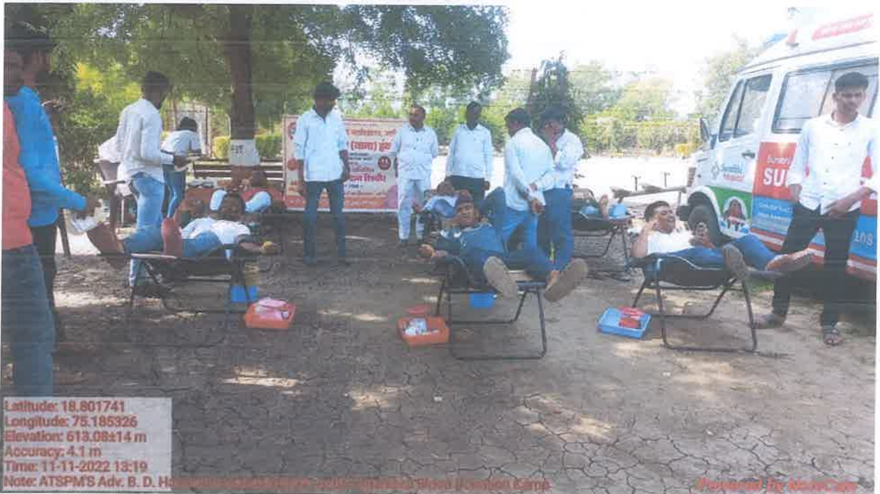
Student and Staff during Blood Donation Camp